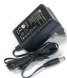
24 V 0.8 A power adapter