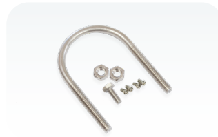
K-70 fastening set