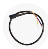
0.35 m 4pin Automotive adapter cable