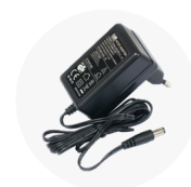
24V 0.8 A power adapter