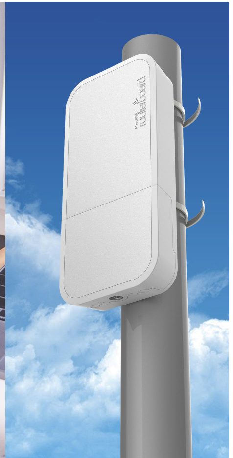
On the pole