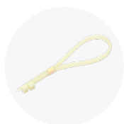
2x plastic straps