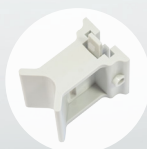
Pole mounting bracket