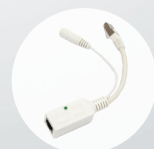
Gigabit PoE injector