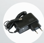
24V 0.38A Adapter