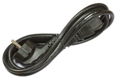
2 IEC cords